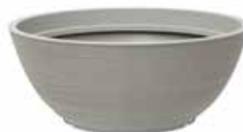
302 dot fog