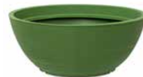
307 dot green