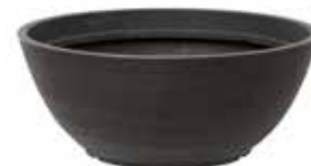
303 dot ash