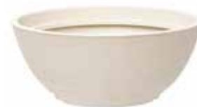
301 dot white