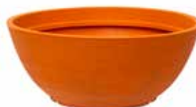
304 dot orange