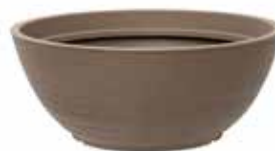
306 dot sand