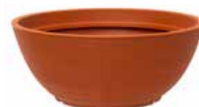
305 dot clay